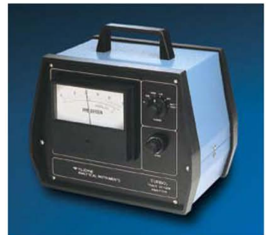
The TURBO 2 Series offers low cost, analog, trace O 2 analysis.