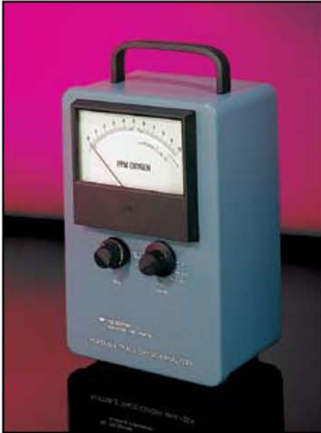
The 311 Series of trace and percent analyzers offers many configurations.

The 311 series provides complete oxygen analysis in a compact package. Offering high accuracy and fast response, this unit is available in four different configurations. The 311 is the basic trace, battery powered unit. The 311D adds a digital meter for easy viewing and readout accuracy. The 311TC and 311PC are trace and percent units which have received CENELEC approval.