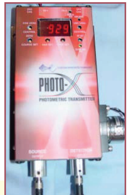
Model 58T fiber optic NIR Photo-X transmitter

Calibration by standard addition is a proven technique that allows a reference check of the flow cell or probe and transmitter without mixing solutions or running samples to a lab. In addition, this technique can be performed without shutting down the process. All span / calibration filters are calibrated against a primary reference filter.