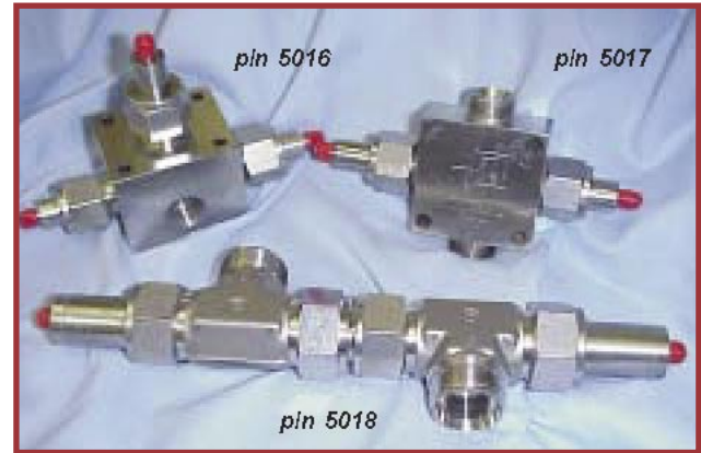
Fluorescence, Cross, and T-Flow cells with OICs

The OICs can be configured to monitor in the UV, VIS, or NIR regions of the spectrum, and can be supplied in 316 SS, Ti, or Hastelloy materials. Windows offered are either quartz or sapphire. Temperature limits of the OICs are -40 to 350° C and the OICs can withstand pressures up to 10,000 psig.