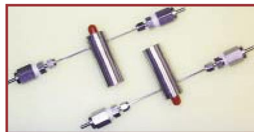
Purged OICs for environmental safety applications