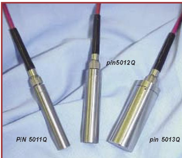
3/8", 1/2" and 3/4" OICs with replaceable windows

Collimating optics directs the light from the photometer or spectrometer through the length of the flow cell and collects the light at the distal end. Light then returns to the spectrometer via the fiber optics.