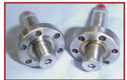
Flange mounted for high vacuum service

Some applications require special designs. Teledyne will consider designing special optical assemblies for customers. Purged OICs or flange mounted / vacuum OICs are examples of custom work.