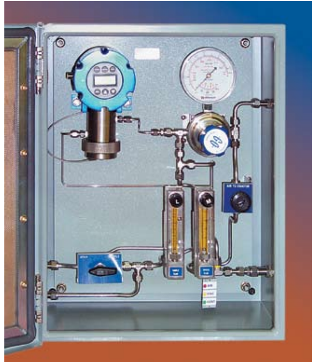
Insta Trans O2 Transmitter for trace O2 detection in petrochemical applications

The Insta Trans is self-certified by Teledyne as suitable for Class I, Division 2 areas without the use of I/S barriers utilizing specific installation guidelines.