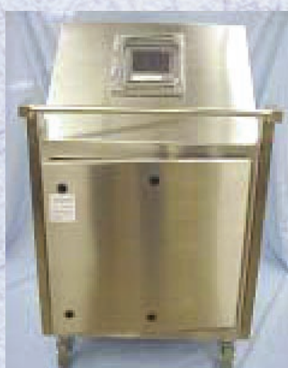
5320-CV Mobile UV cart and recorder

At the heart of the cleaning validation system is a recorder that records the signals from the UV detectors in accordance with the FDA's 21CFR11 electronic records, electronic signatures final ruling.