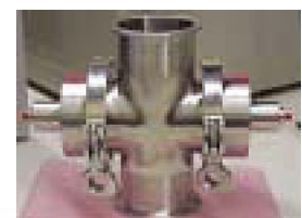
Fiber Optic cross flow shown with sanitary fitting