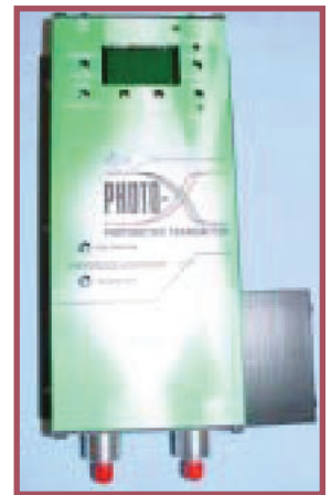
Model 58T Corrosion Transmitter

Teledyne offers a low cost fiber optic based Photometric transmitter that produces a 4-20mA signal proportional to the amount of Reflectivity from the corrosion probe. The transmitter is also supplied with an automatic/manual or remote means of verifying the response of the transmitter.