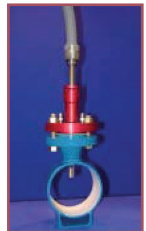
Corrosion Probe Pipeline Retraction

All optical probes have been tested to withstand pressures up to 10,000 psig and temperatures up to 300° C.